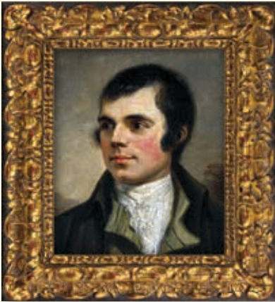
Robert Burns by Alexander Naysmith

Robert (Rabbie) Burns was a Scottish poet and lyricist. He is widely regarded as the national poet of Scotland and is celebrated worldwide, usually with a meal of Haggis taken with a wee dram or two!