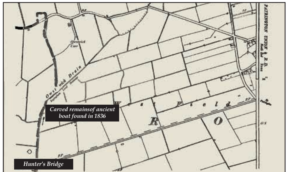
The illustration of a map previously held by Holderness Borough Council clearly shows the earlier existence of Hunters Bridge!

Close examination of the map will reveal that should the Order be confirmed, enthusiastic walkers will have the opportunity to walk directly from Burton Pidsea along Roos Parish Path No 5 and 6 to finish at the cliff top near Sand le Mere.