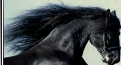
The Black Horse, Main Street, Roos Tel.01964 670405