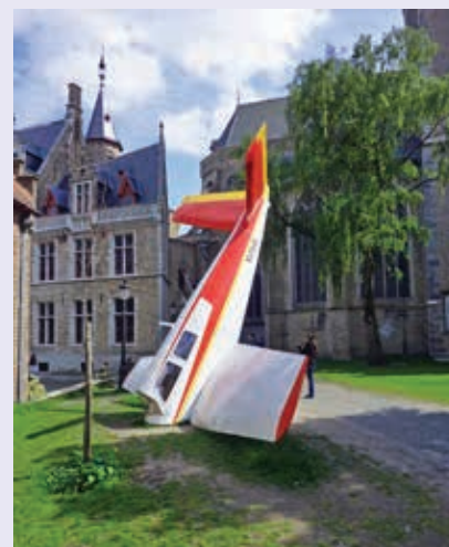
in Bruges and its title 'Out of Place'.